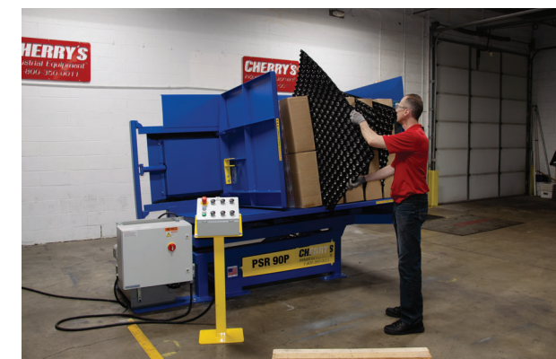
Ergonomically correct height for easy removal