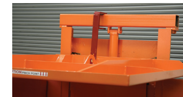
Maintenance Lock Bar