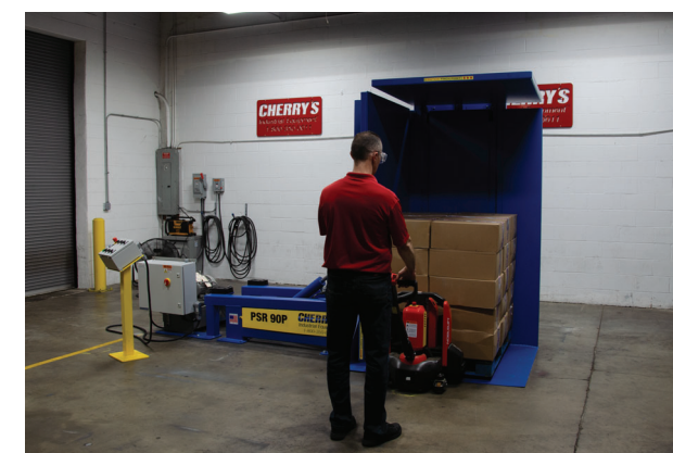
PSR73 in reclined position