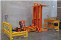
CRASH GUARDING: Prevents accidental damage to machine and power unit from forklift traffic.

Optional guarding to protect the equipment from forklift damage or operators from harm.