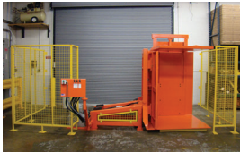
HIGH STYLE GUARDING: Provides additional protection for forklift operators (mounted directly to the machine).

Give us a call at 800-350-0011 Email sales@cherrysind.com or visit cherrysind.com