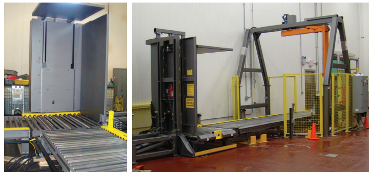
Conveyor Fed 90° Transfer Direct Load