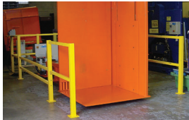
PERIMETER GUARDING: Pinch point protection for machine operator while still allowing access to pallet and freezer spacers.