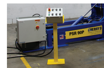
Start/Stop Control Panel